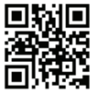
SSAFA Support & Advice