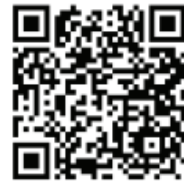
Help for Heroes Live Well Charity