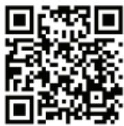
Defence Medical Welfare Service Healthcare Charity