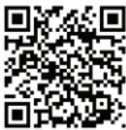
Royal British Legion Support & Advice