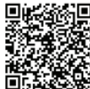
Blind Veterans UK Sight Loss Charity