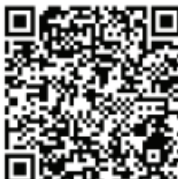
Op COURAGE Mental Health