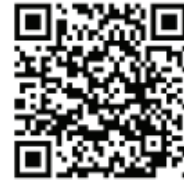
Veterans Gateway Directory of Services