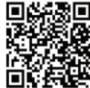
Op Fortitude Homelessness