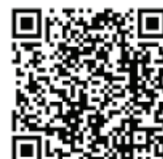
Op NOVA Criminal Justice